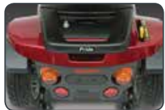
Full Lighting Package

The Pursuit ® incorporates a blend of power, style and performance to handle rugged outdoor terrain. The powerful drivetrain, 24 Volt, 4-pole motor for increased power, 3.56" ground clearance and maximum speed of 8 mph combine power and torque to accelerate your active lifestyle. Standard features include feather touch disassembly, wraparound delta tiller, 13" low-profile solid tires, front and rear suspension, high-back reclining seat, full lighting package, infinitely-adjustable tiller, front basket and rearview mirror. Available in Red and Silver.