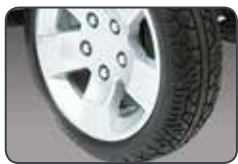
13" Low-profile Tires