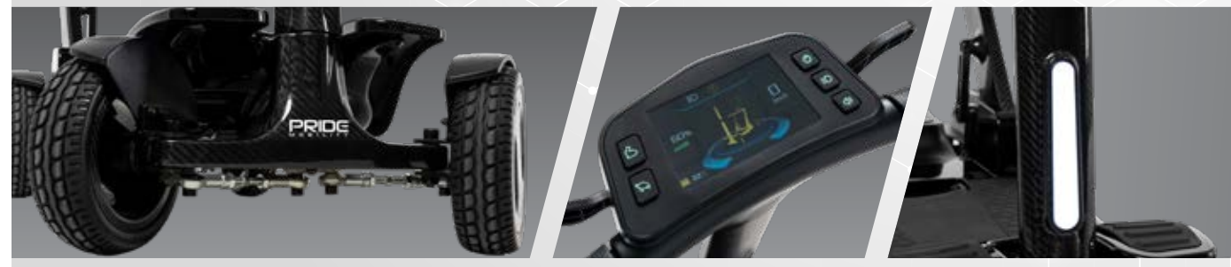
Pride's exclusive lightweight, non-scuffing tires